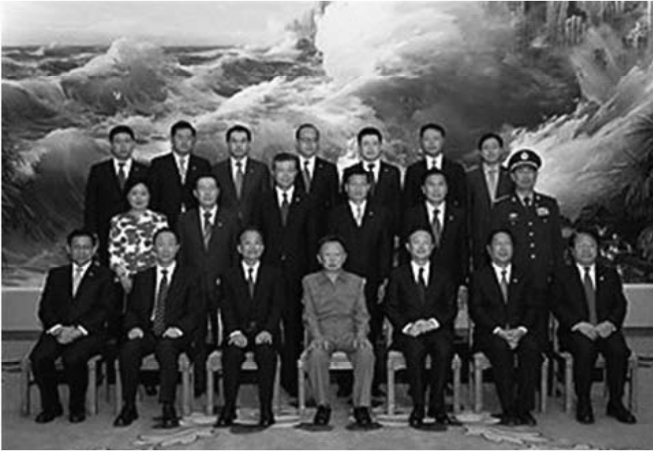
Figure 5: Delegation to North Korea Led by Chinese Premier Wen Jiabao, October 2009