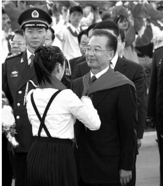
Figure 4: Wen Jiabao Receives Symbolic Communist Party Scarf during Visit to North Korea, October 2009