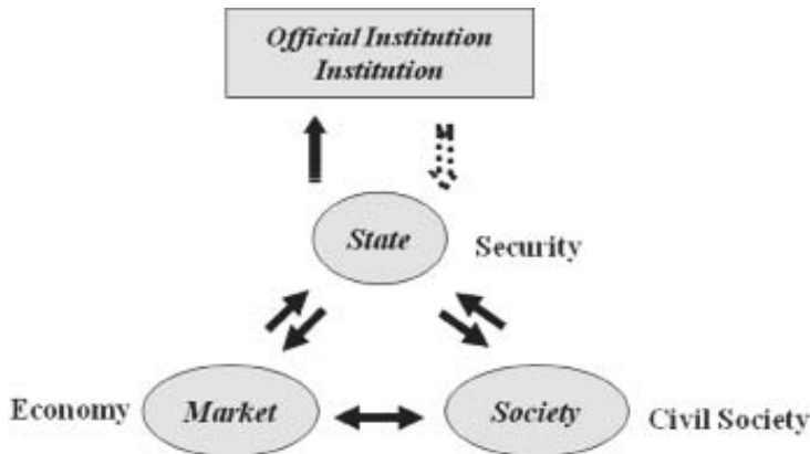
Figure 3: Weberian Model for Regional Integration